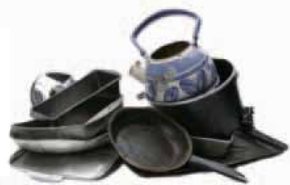
Kitchen Cookware Metal pots, pans, tins & utensils