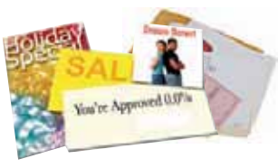
Office Paper & Junk Mail Envelopes, Flyers, Brochures, Postcards, etc.