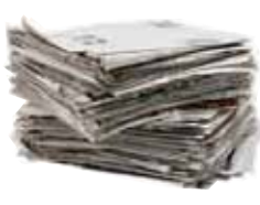
Newspaper Remove bags, strings & rubber bands