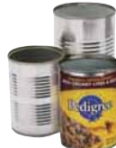
Steel & Tin Cans Empty cans only