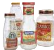
Empty & Clear Bottles & Jars Only