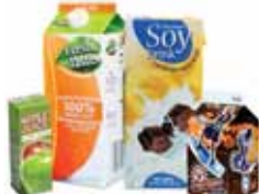
Food & Beverage Containers Empty containers only