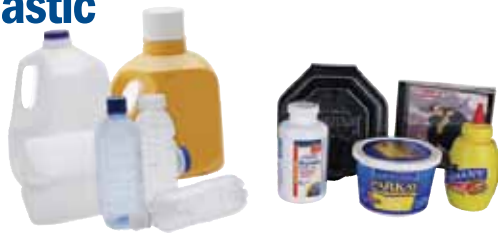
Plastic Jugs/Bottles/Household Plastic Empty containers only