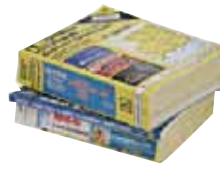
Phone Books All types & sizes