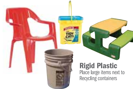
Rigid Plastic Place large items next to Recycling containers