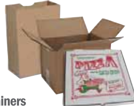
Cardboard, Pizza Boxes & Paper Bags Flatten cardboard and if needed put next to your tote at no more than 4' pieces . Remove wax paper from pizza boxes