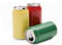
Aluminum Cans Empty cans only