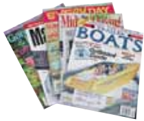
Magazines & Catalogs All types & sizes